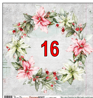
JOYFUL NOISE PD4803