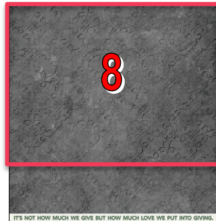
CHRISTMAS PIZAZZ PD4800