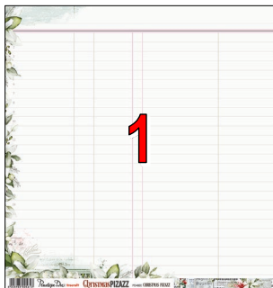
CHRISTMAS PIZAZZ PD4800

Numbers in [red] indicate placement as noted in layout instructions.