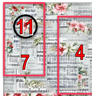
JOYFUL NOISE PD4803