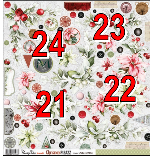
SPARKLE & SHINE PD4805